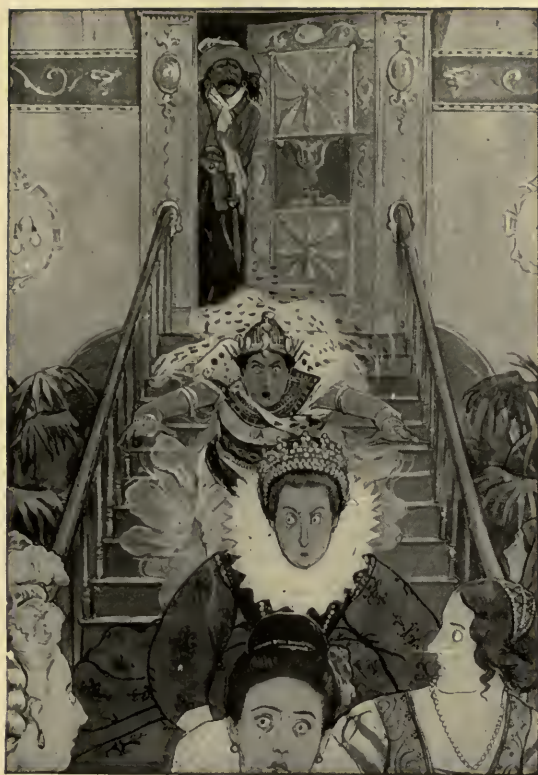
"THE HARD FEATURES OF KIDD WERE THRUST THROUGH"